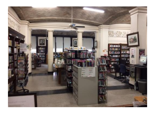
First floor reading and browsing area (2018)

In 1991 the current building had its one renovation with the addition of an elevator. This part of the building is crumbling. Until recently, it was also leaking, both on the second floor roof (where it was added to the original building) and in the lower level.