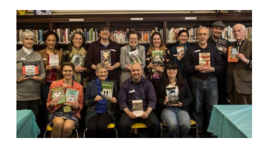
Author fair 2018

According to state regulations, sixteen percent of the library's appropriated budget must be spent on materials for patrons. Currently the library is limited by space in addition to budget. Belonging to a network as big as CWMARS does allow patrons access to over a million items without having to store them here.